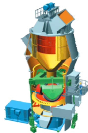
Gebr. Pfeiffer MPS Vertical Roller Mill for Clinker

Cementos San Marcos SA is a newly established company owned by a consortium of companies; The Family Otoyá Dominguez, The Siderurgica de Occidente SIDOC S.A. and CSS Construcciones SA.